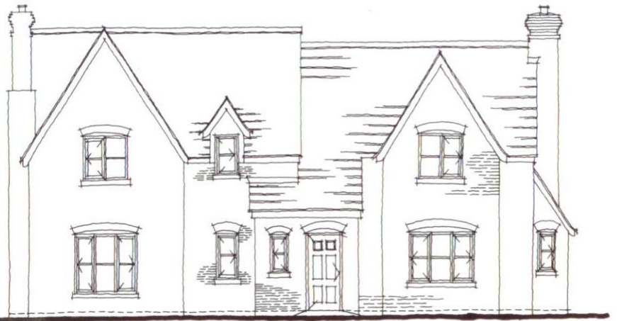
EXISTING FRONT ELEVATION TO HOUSE.